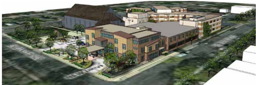
Artist rendering of the future 24-bed Transitional Care Unit addition.